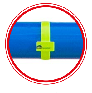
Roll clips REF : PHTIASR