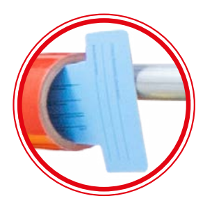
Media cards REF : PHTIEIR